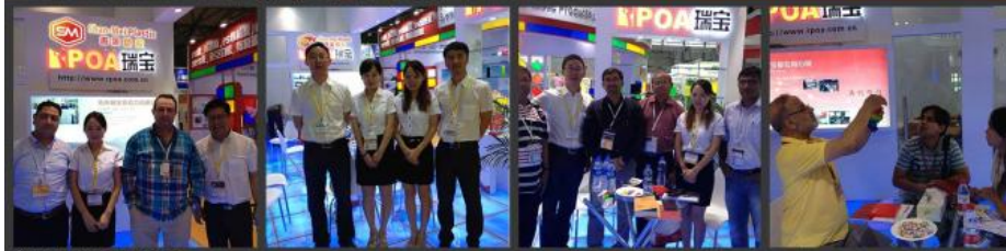
↑ EXHIBITION QUZHOU PERFECT PLASTIC MATERIAL CO.,LTD