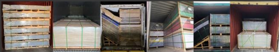
↑ ABOUT THE PACKING QUZHOU PERFECT PLASTIC MATERIAL CO.,LTD