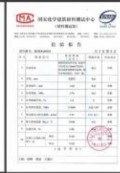
↑ CERTIFICATE QUZHOU PERFECT PLASTIC MATERIAL CO.,LTD