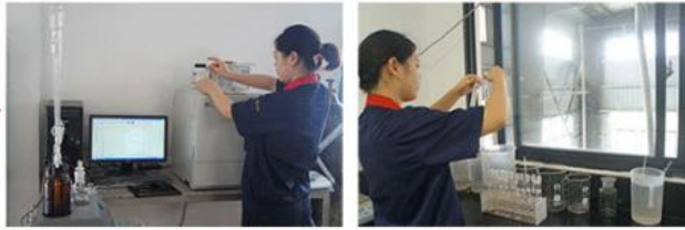
The Reaction process of material