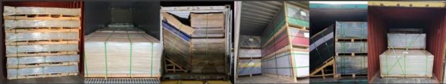
↑ ABOUT THE PACKING QUZHOU PERFECT PLASTIC MATERIAL CO.,LTD