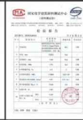
↑ CERTIFICATE QUZHOU PERFECT PLASTIC MATERIAL CO.,LTD