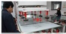
Step6 - Release process and Test for the products