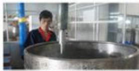
Step3 - The blending process of material