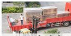
Step8 - Cargo transportation