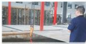
Step5 - Solidifying and molding process of material