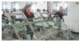
Step4 - The feeding process of material