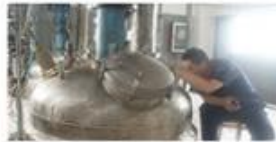
Step2 - The Reaction process of material