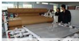
Step7 - Packing for the products