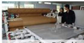
Step7 - Packing for the products