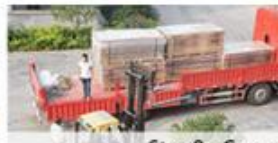
Step8 - Cargo transportation