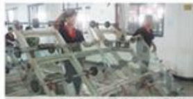
Step4 - The feeding process of material