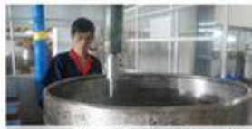
Step3 - The blending process of material