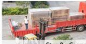
Step8 - Cargo transportation