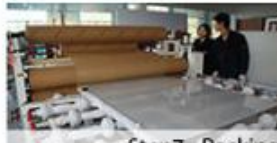
Step7 - Packing for the products