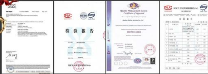
↑ CERTIFICATE QUZHOU PERFECT PLASTIC MATERIAL CO.,LTD