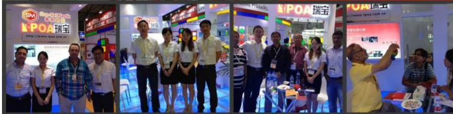
↑ EXHIBITION QUZHOU PERFECT PLASTIC MATERIAL CO.,LTD