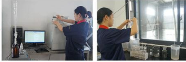
The Reaction process of material