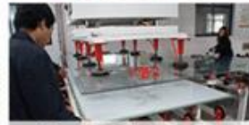
Step6 - Release process and Test for the products