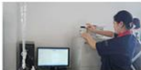
Step1 - Test for raw materials and auxiliary materials