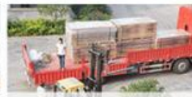
Step8 - Cargo transportation