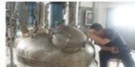
Step2 - The Reaction process of material