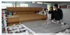
Step7 - Packing for the products