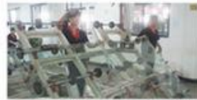
Step4 - The feeding process of material