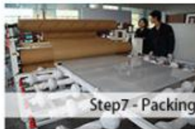
Step7 - Packing for the products