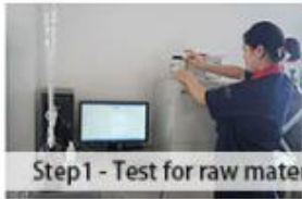
Step1 - Test for raw materials and auxiliary materials