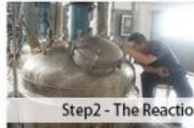
Step2 - The Reaction process of material