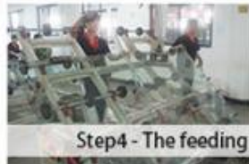
Step4 - The feeding process of material