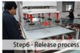
Step6 - Release process and Test for the products