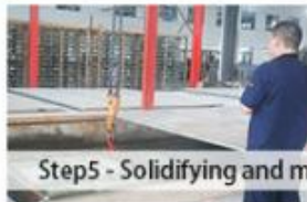
Step5 - Solidifying and molding process of material