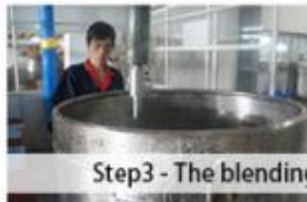
Step3 - The blending process of material