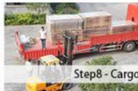
Step8 - Cargo transportation