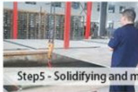
Step5 - Solidifying and molding process of material