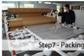
Step7 - Packing for the products