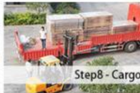
Step8 - Cargo transportation