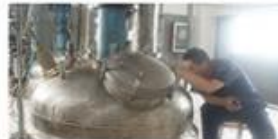
Step2 - The Reaction process of material