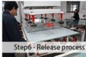
Step6 - Release process and Test for the products