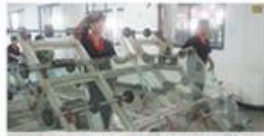
Step4 - The feeding process of material