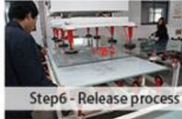
Step6 - Release process and Test for the products