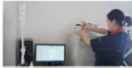
Step1 - Test for raw materials and auxiliary materials