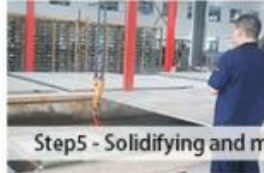
Step5 - Solidifying and molding process of material