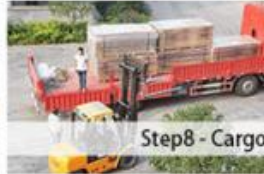
Step8 - Cargo transportation