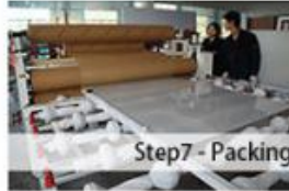
Step7 - Packing for the products