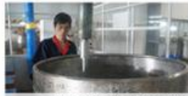
Step3 - The blending process of material