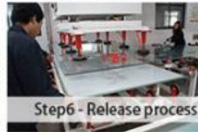
Step6 - Release process and Test for the products