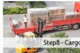
Step8 - Cargo transportation