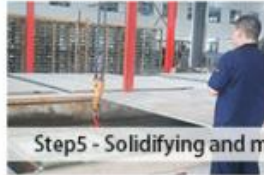
Step5 - Solidifying and molding process of material