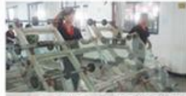
Step4 - The feeding process of material