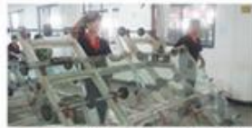
Step4 - The feeding process of material